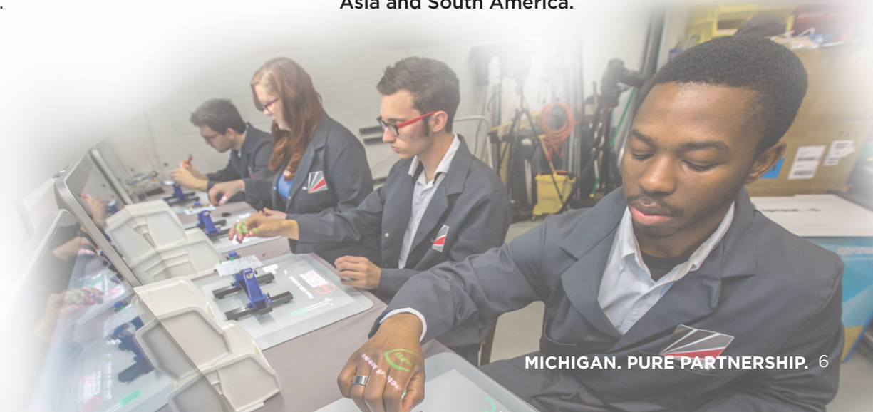
MICHIGAN. PURE PARTNERSHIP. 6

Due to increasing sales in Europe and China, OPS Solutions has opened offices in Czechia and China to assist with its international exports. The company is tracking to increase sales by 70 to 100 percent over 2020 and expects to continue using the MEDC International Trade Program to accelerate its international expansion in Europe, Asia and South America.