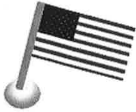
The United States of America