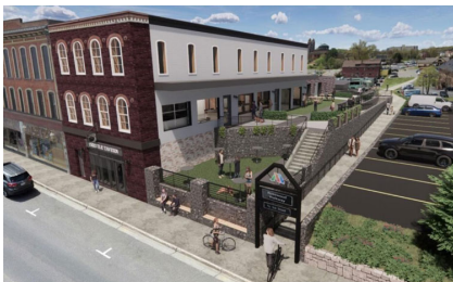
Ore Dock mixed-use development

Marquette , an MEDC-certified Redevelopment Ready Community , is an Upper Peninsula destination and thriving downtown filled with attractions for community members and tourists alike. Through ongoing and recent revitalization projects like brownfield redevelopment at the Marquette General Hospital and the expansion of Ore Dock Brewery to include residential units and commercial space, downtown Marquette’s placemaking success continues to showcase all that the U.P. has to offer.