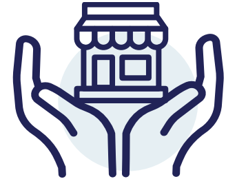
Ongoing Small Business Support