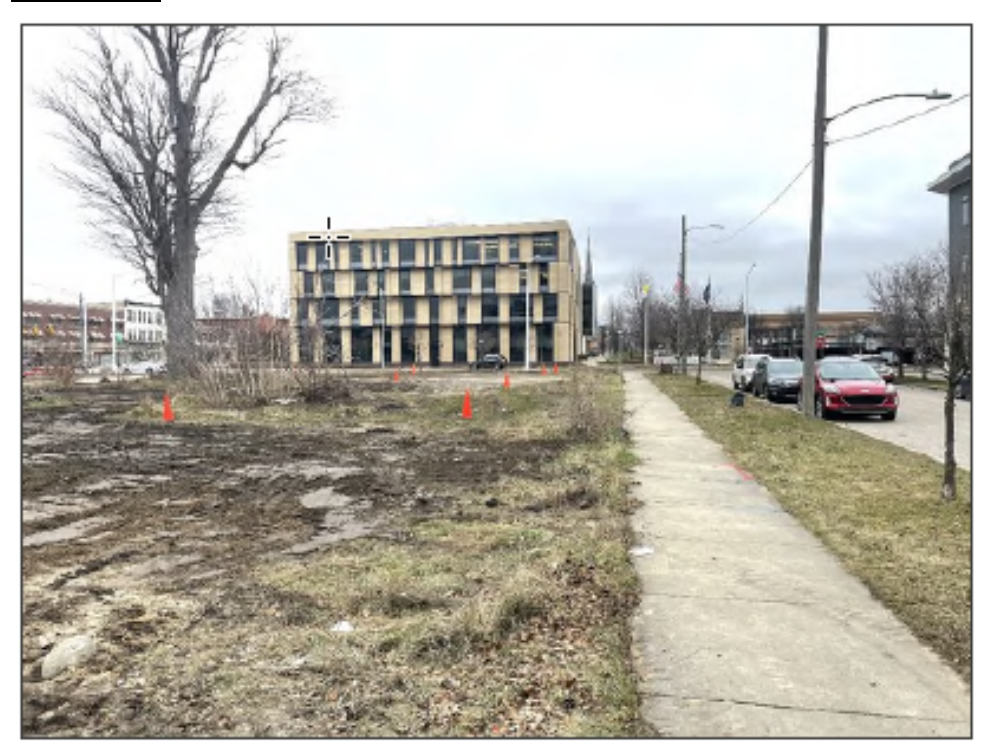
PHOTO NO. 2: View of the eastern portion of the Property facing north along the Sheldon Avenue SE sidewalk.