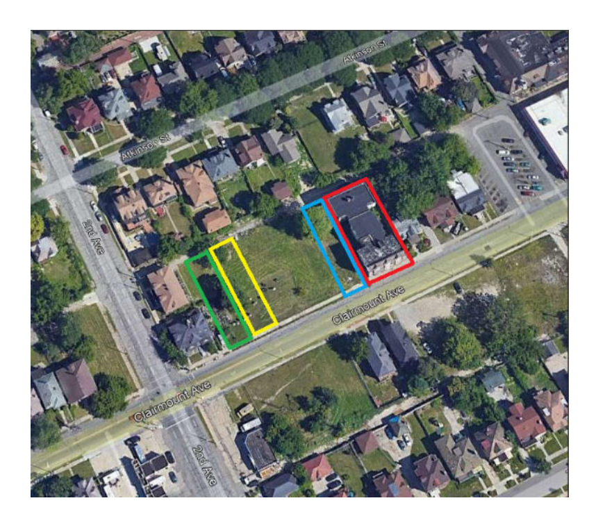
APPENDIX B – Project Map and Renderings