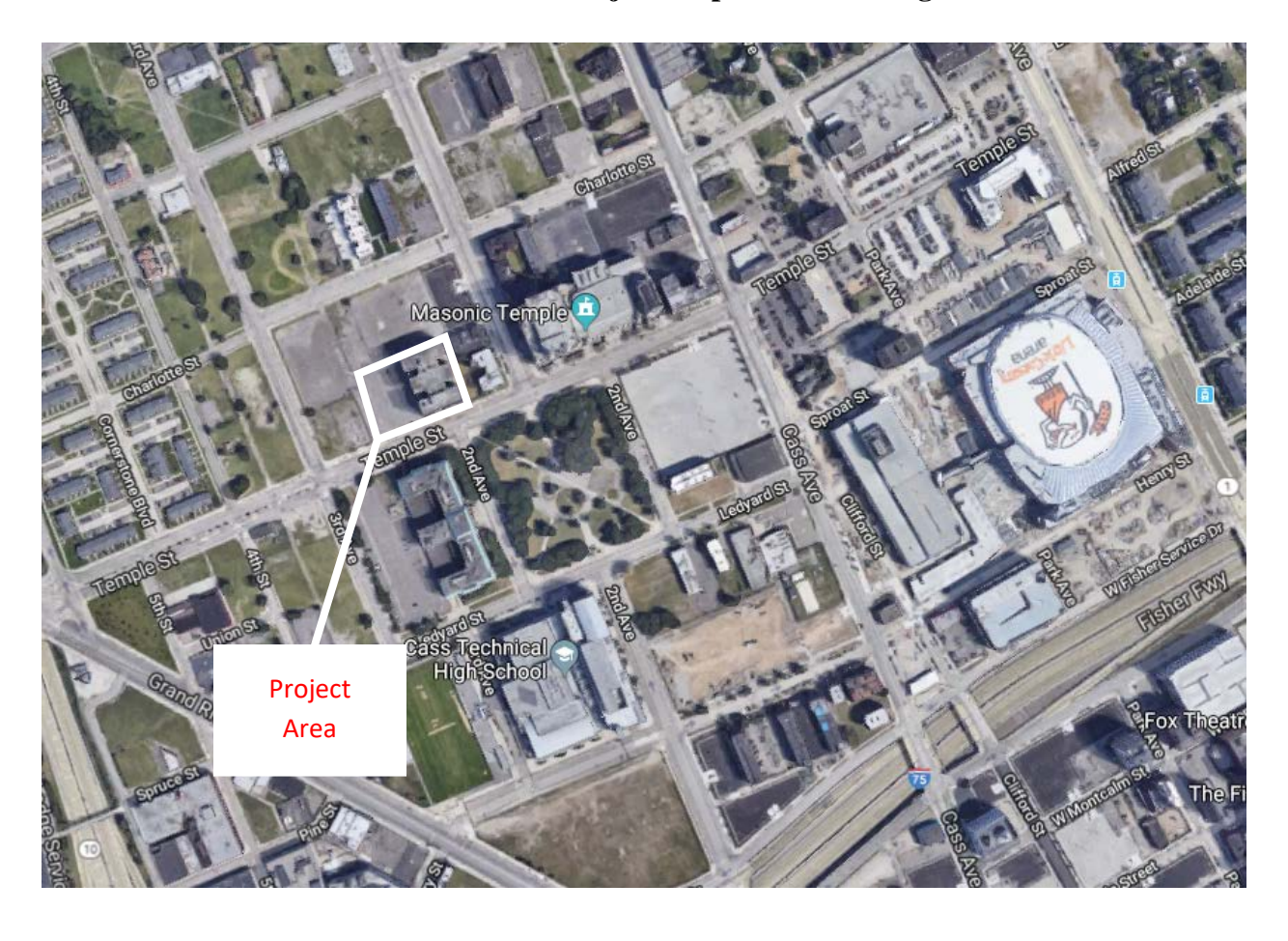
APPENDIX A – Project Map and Renderings