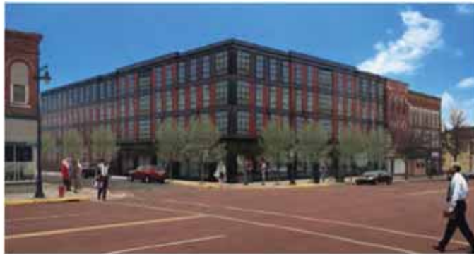
VIEW FROM CORNER OF S. SUPERIOR ST. & W. PORTER ST.