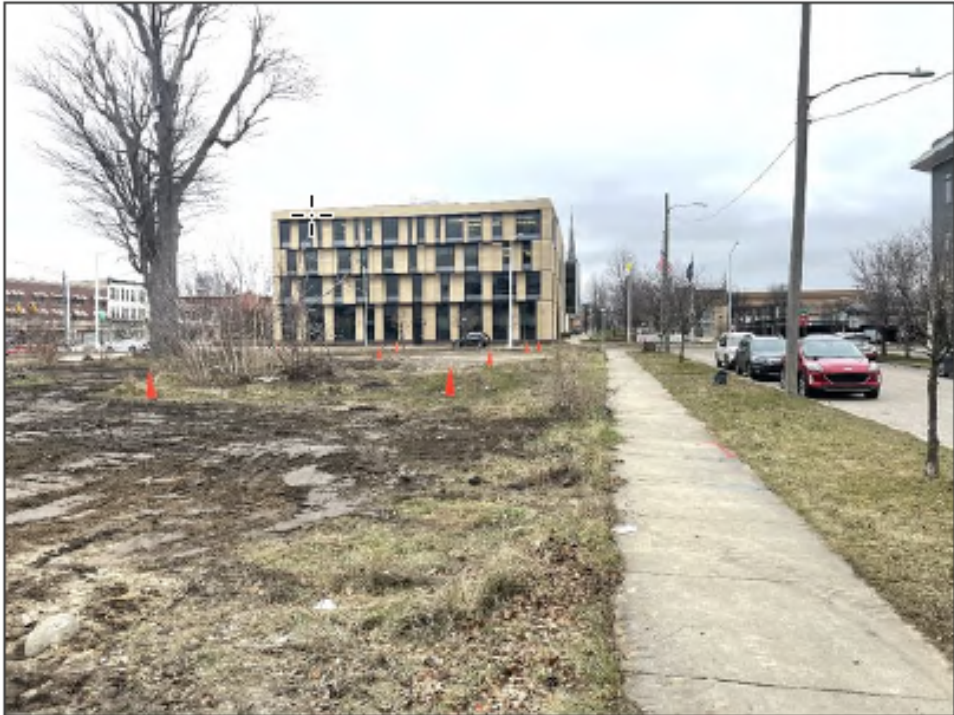
PHOTO NO. 2: View of the eastern portion of the Property facing north along the Sheldon Avenue SE sidewalk.